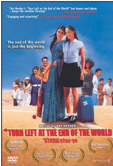
Posters showcasing "Turn Left at the end of the World" at left and "Noodle," to be shown in May at Cumberland County College.

The first, "Live and Become," was screened on May 13. The remaining two are "Noodle," to be presented May 17, and "Turn Left at the End of the World" on May 27. All three are award winners at various film festivals throughout the world and all transcend the limits of race, religion and nationality. They are rich presentations of the human condition in various stages of conflict and crisis.