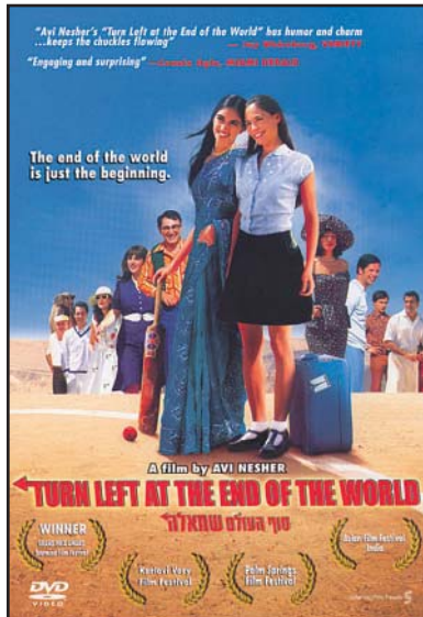
Posters showcasing "Turn Left at the end of the World" at left and "Noodle," to be shown in May at Cumberland County College.

The first, "Live and Become," was screened on May 13. The remaining two are "Noodle," to be presented May 17, and "Turn Left at the End of the World" on May 27. All three are award winners at various film festivals throughout the world and all transcend the limits of race, religion and nationality. They are rich presentations of the human condition in various stages of conflict and crisis.