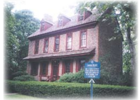
Farm Day will be celebrated at the Gibbon House on Ye Greate Street in Historic Greenwich on April 27 from noon to 4:00PM.

Farm Day is the perfect chance to enjoy the charm and tranquility of one of Cumberland County's hidden treasures. In addition to the Gibbon House Museum, other