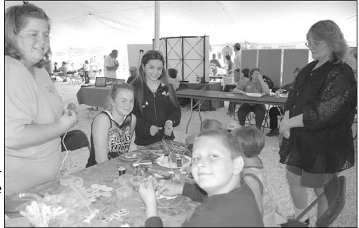
The Bay Days Festival features a number of events for young adults including crafts, games, and other fun activities.

Groups, clubs, and individuals are also invited to participate in the street parade where awards will be presented for "Best Pedestrian," "Best Bicycler," "Best Performance," and other fun categories. Additional activities for the entire family include Blue Crab races, crafts, games, multi-ethnic performances, fresh seafood, artisans and crafters, oyster shucking