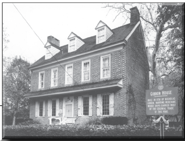
1730 Nicholas Gibbon House, Greenwich.

For more information, call the Cumberland County Historical Society at 856-455-4055 or visit www.cchistsoc.org .