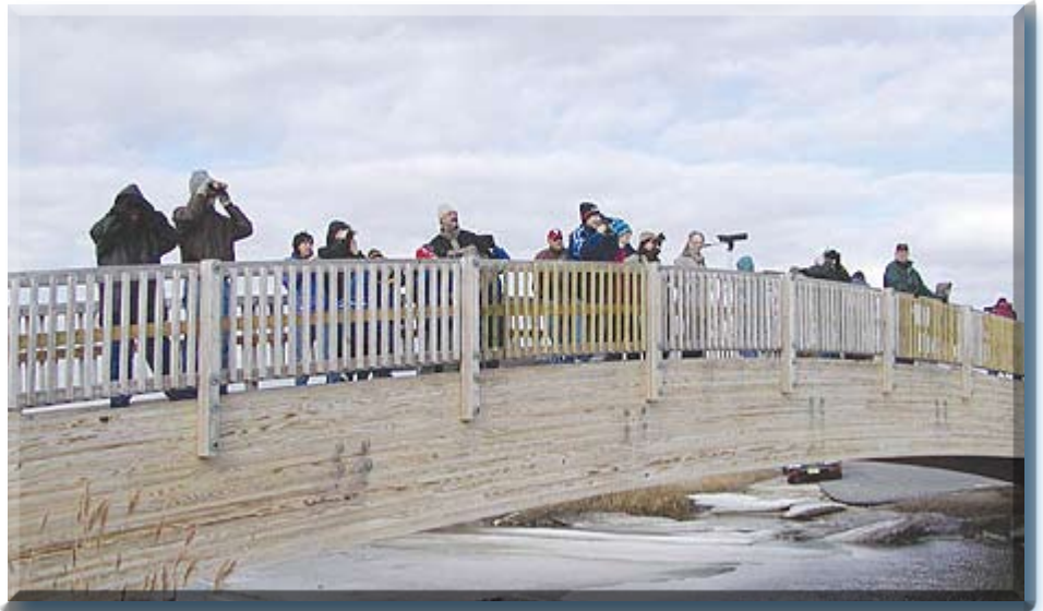
Bird enthusiasts will find plenty to see and do at the 2009 Winter Eagle Festival.

"With wingspans of six to eight feet and weights of up to 16 pounds, the American Bald Eagle has made the open water, marshes, and woodlands of Cumberland County one of their winter homes,"