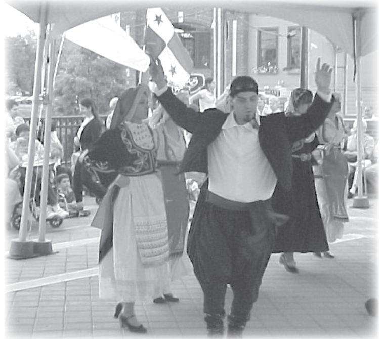
Cultural dancing will be a big part of the Multi-cultural Week events in Millville.

In addition to the performances, student artwork will be displayed, and winners of the Millville School District Multi-Cultural Essay Contest will be announced. There will also be cultural tables containing information, art, and history from different community groups.